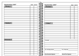
Workman Assignment Keeper