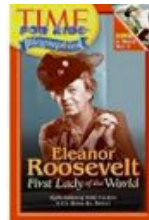
Time for Kids